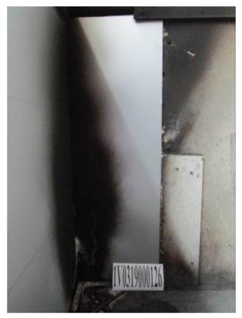
After test (Short wing)