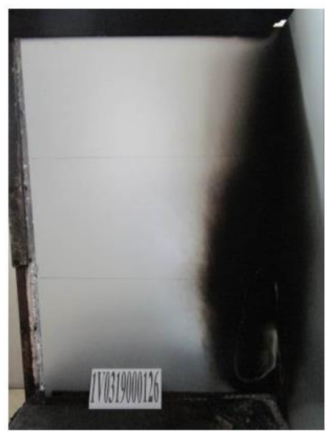
After test (Long wing)