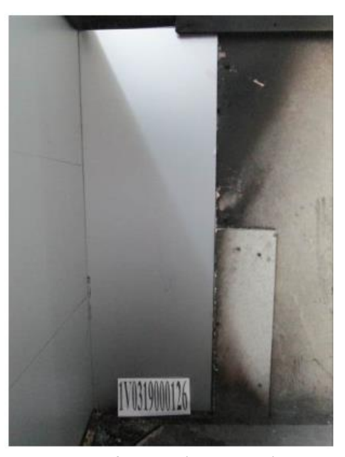
Before test (Short wing)