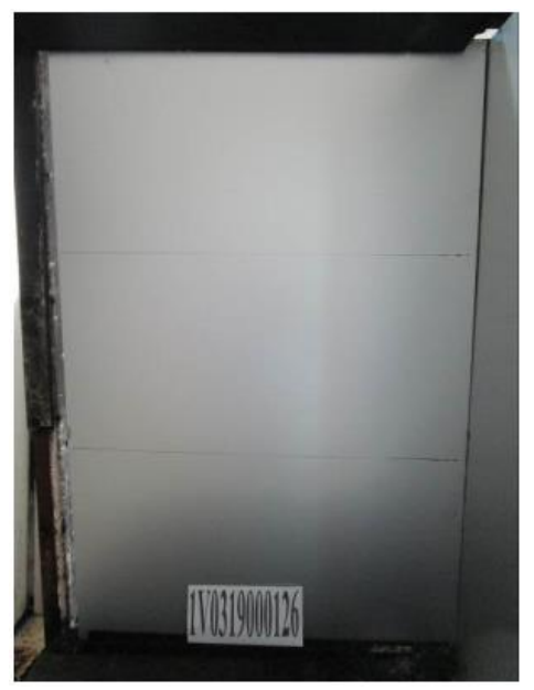
Before test (Long wing)